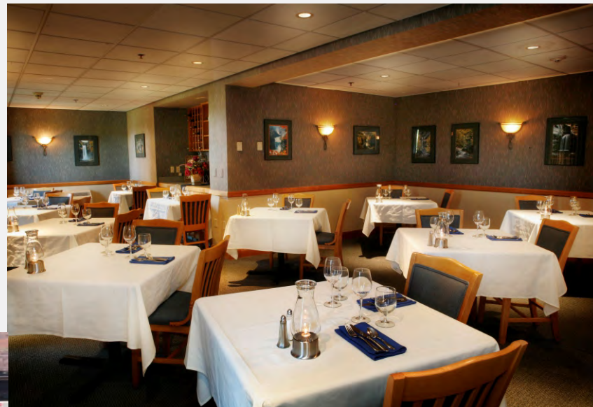
Lower Level Conference Banquet Room

*An on site beer pub could become very popular.