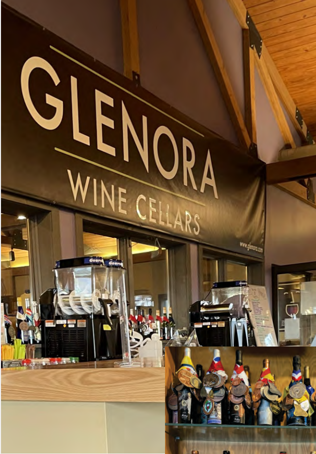
Award Winning Wines