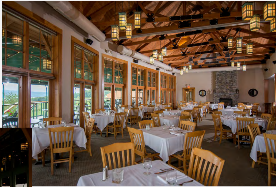
Covered Porch Dining with Lake Views

PRESENTED BY HENRY KIMBALL FLXWINERY4SALE.COM