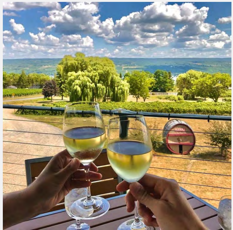
Vineyard and lake view from the Inn