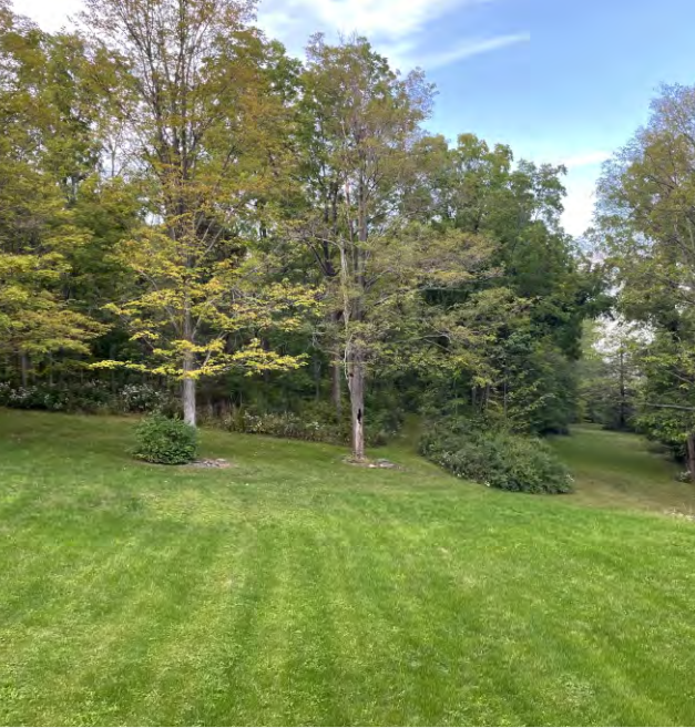
14 Acres with Walking Trails