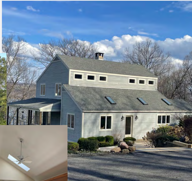
Private Setting, Year Round Home