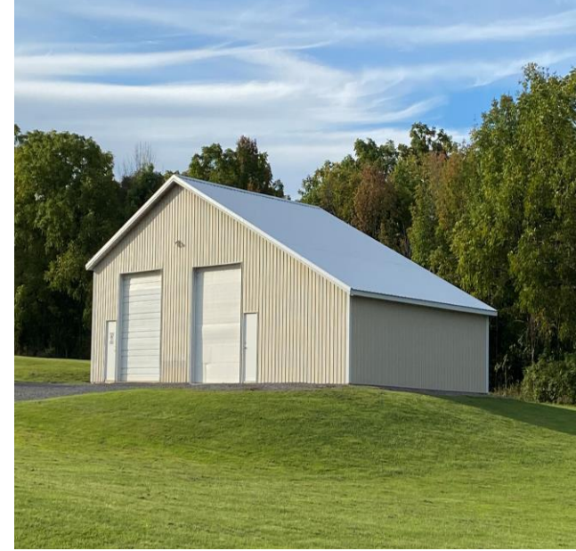
Independently Owned and Operated / A Member of the Cushman & Wakefield Alliance Cushman & Wakefield Opyright 2015. No warranty or representation, express or implied, is made to the accuracy or completeness of the information contained herein, and same is submitted subject to errors, omissions, change of price, rental or other conditions, withdrawal without notice, and to any special listing conditions imposed by the property converges. As applicable, we make no representation as to the condition of the properties) in question.