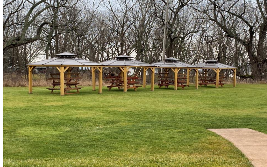
Independently Owned and Operated / A Member of the Cushman & Wakefield Alliance Cushman & Wakefield Copyright 2015. No warranty or representation, express or implied, is made to the accuracy or completeness of the information contained herein, and same is submitted subject to errors, omissions, change of price, rental or other conditions, withdrawal without notice, and to any special listing conditions imposed by the property owner(s). As applicable, we make no representation as to the condition of the property (or properties) in question.