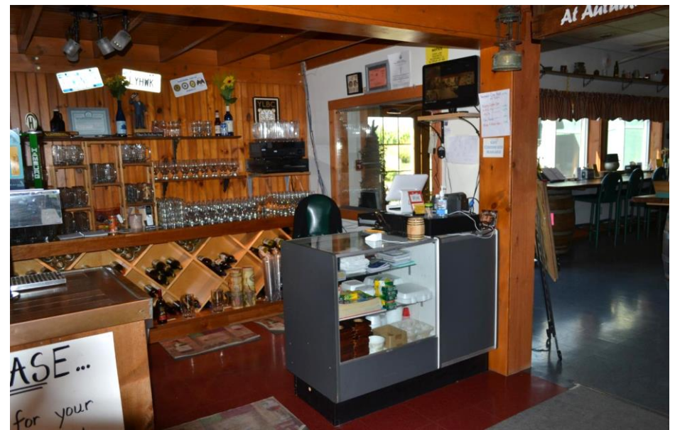
Independently Owned and Operated / A Member of the Cushman & Wakefield Alliance Cushman & Wakefield Opyright 2015. No warranty or representation, express or implied, is made to the accuracy or completeness of the information contained herein, and same is submitted subject to errors, omissions, change of price, rental or other conditions, withdrawal without notice, and to any special listing conditions imposed by the property owner(s). As applicable, we make no representation as to the condition of the properties) in question.