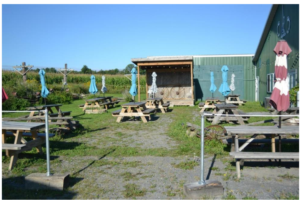
Independently Owned and Operated / A Member of the Cushman & Wakefield Alliance Cushman & Wakefield Copyright 2015. No warranty or representation, express or implied, is made to the accuracy or completeness of the information contained herein, and same is submitted subject to errors, omissions, change of price, rental or other conditions, withdrawal without notice, and to any special listing conditions imposed by the property owner(s). As applicable, we make no representation as to the condition of the property or properties) in question.