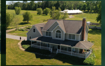
2 RESIDENTIAL HOME