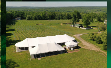
3 EVENT CENTER